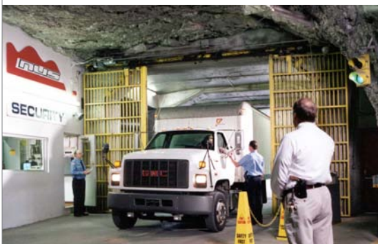
National Underground Site (NUS) facility provides unsurpassed Data Center security (Available Fall 2006)

The Connected Backup/PC solution provides the highest levels of digital security available. Data is encrypted at the desktop, using government-level, 128-bit, Advanced Encryption Standard (AES). All desktop and laptop data is kept encrypted both during transmission and in storage.